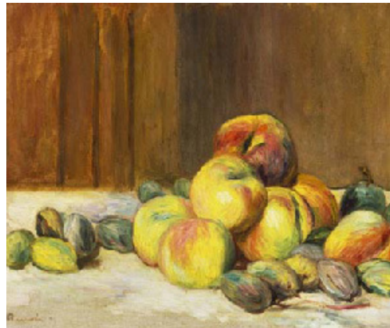
Pierre-Auguste Renoir - Peaches and Almonds

His next step was to create the Urban Cely Golf Club in the grounds of the Chateau de Cely.