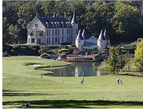
Golf de Cely en Biere, Club House