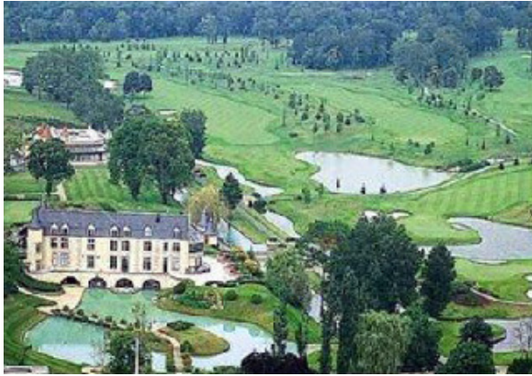
Golf de Cely en Biere