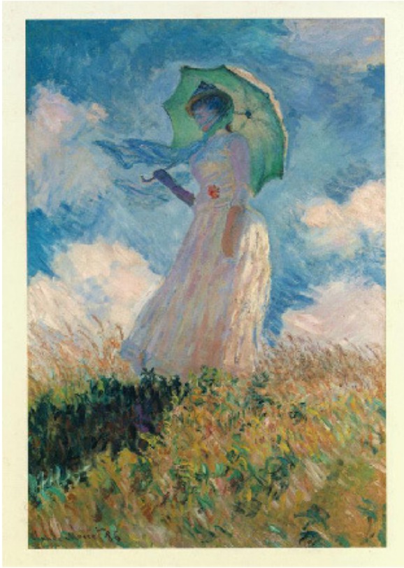
Claude Monet - Woman with parasol