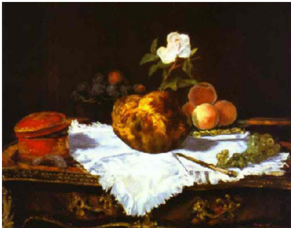
Edouard Manet - The Brioche