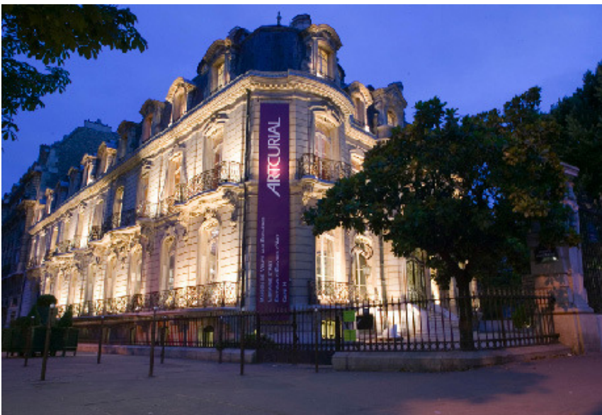
Hôtel particulier Marcel Dassault on the Rond Point des Champs Elysées