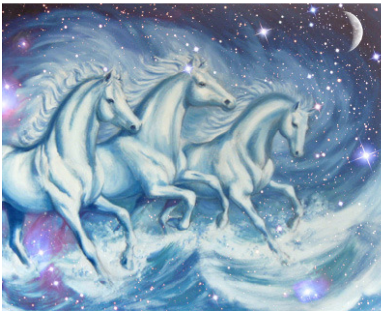
Horses of the Sea, Chinese emperors' horses