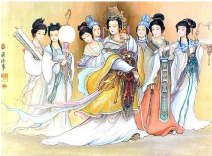
Wu Zetian, the only female emperor in the history of China ( 618-906AD )

It was M. Lesbordes' turn to look mystified. Had the fabled Sport of Kings come to this? Did that man perhaps find himself empathizing with Martin Luther's misogynist dictum – 'Never any good came out of female domination'? However he ignored that China had a female emperor in the name of Wu Zetian.