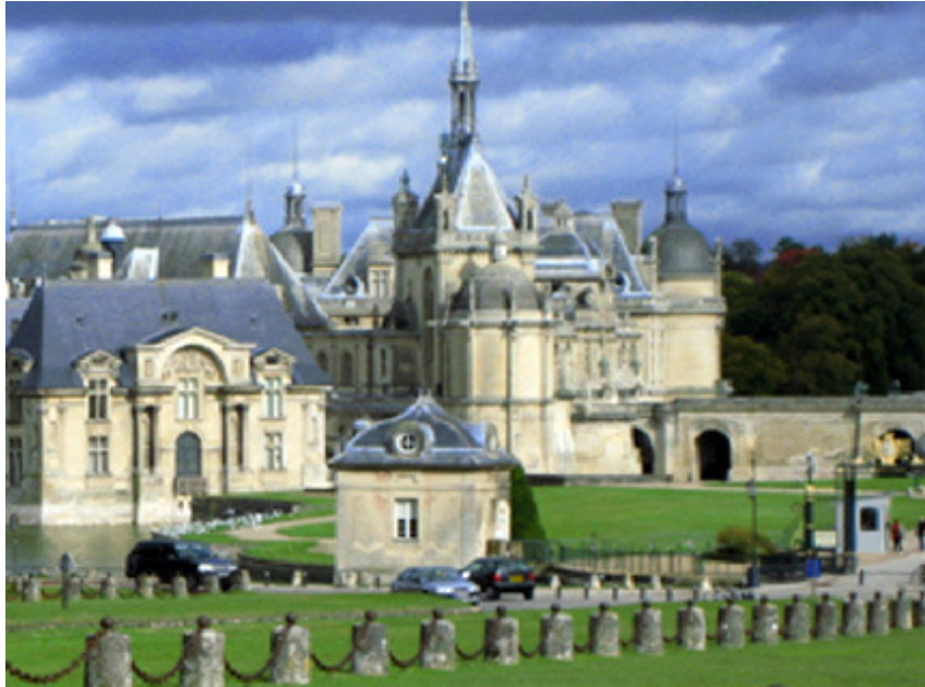
Stables at Lamorlaye