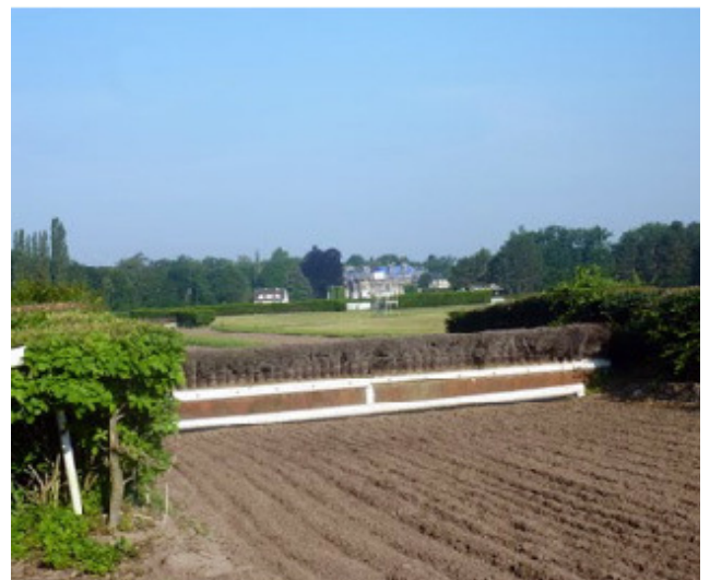
Schooling hurdle training centre at Lamorlaye