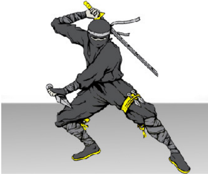
maybe in this French countryman's mind- Japanese is Ninja