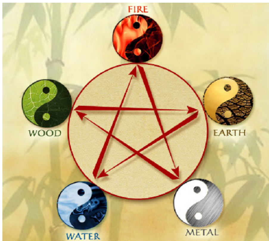
The Chinese law of five elements : Gold, wood, water, Fire and Earth

Faced with this unpalatable fait accompli, the disillusioned owner I was could only respond that the only one of those names acceptable to me was Urban Sea, for the reason that in Chinese astrology I had been born under an 'earth' sign and thus needed 'water' to fertilise my enterprises.