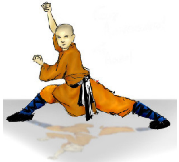
Chinese is Kung Fu