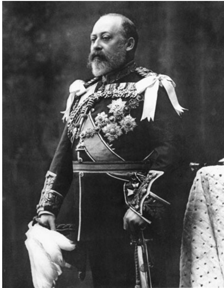
Her Majesty the Queen's great-grandfather King Edward VII won the Derby twice in 1896 and 1900, both colts were out of the same dam Perdita II

The second mare to breed two winners of the Derby sounded better. Galtee More (1897) and Ard Patrick (1902) both out of the same dam Morganette but by different sires. Galileo is by Sadler's Wells. Sea The Stars is by Cape Cross out of Urban Sea.