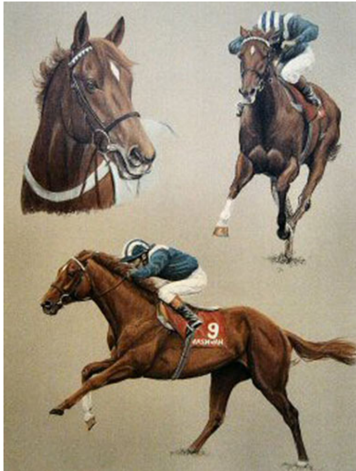
Nashwan the last horse to complete the Guineas-Derby double 20 years ago