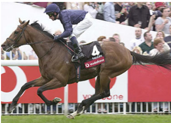
Galileo foaled in 1998 by Sadler's Wells out of Urban Sea

The second mare to breed two winners of the Derby sounded better. Galtee More (1897) and Ard Patrick (1902) both out of the same dam Morganette but by different sires. Galileo is by Sadler's Wells. Sea The Stars is by Cape Cross out of Urban Sea.