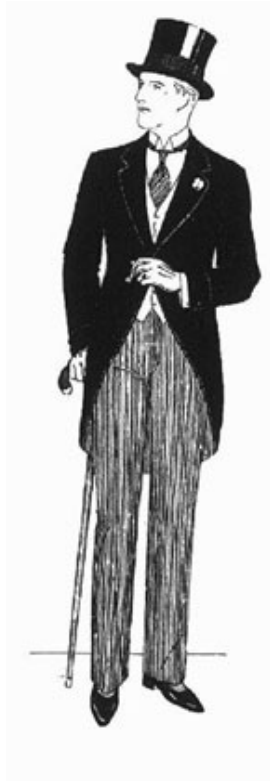
Gentlemen have to wear a morning suit in the enclosure at Epsom on Derby Day