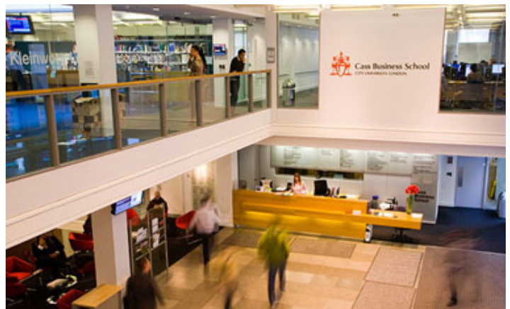
CASS Business School Hall