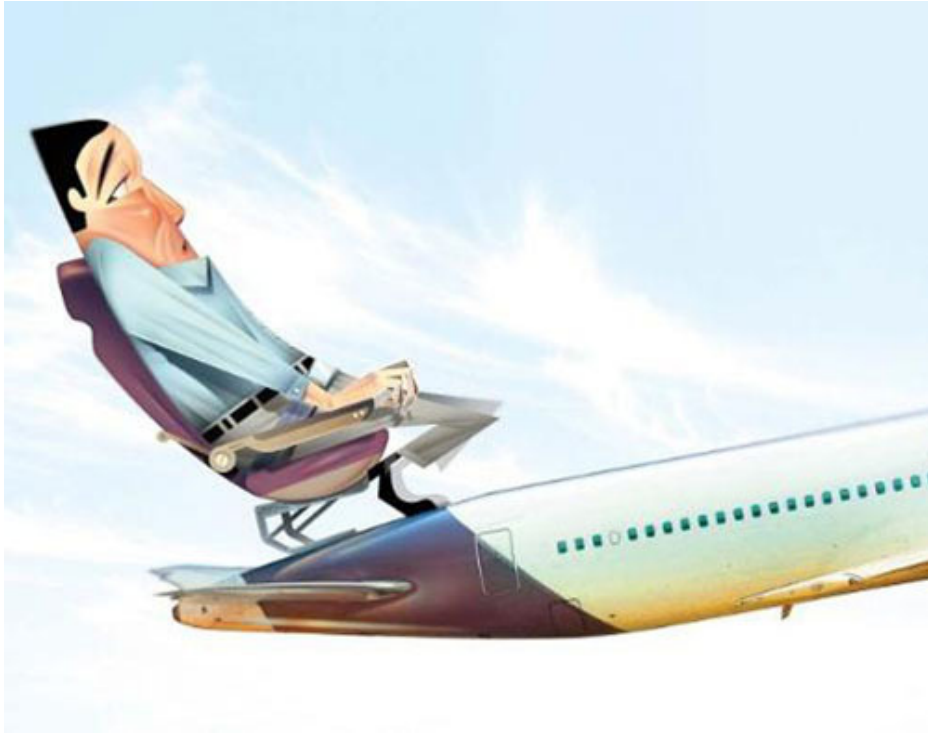
The tension, the anxiety and the weight of expectation

But arrive for the Derby I did, two days before the great race. I checked into the Mandarin Oriental in Knightsbridge.