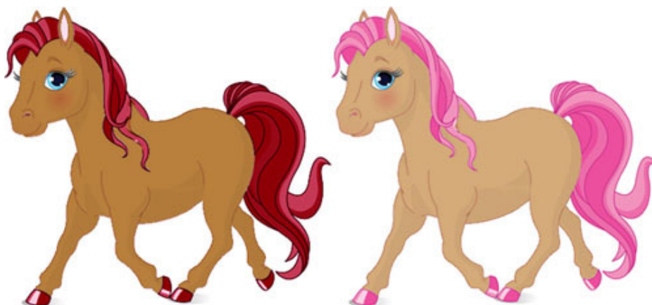
Just two such mares who had produced 2 Derby winners in 100 years; Perdita II and Morganette