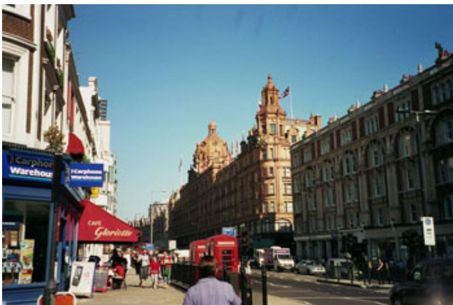
Knightsbridge, shopping paradise