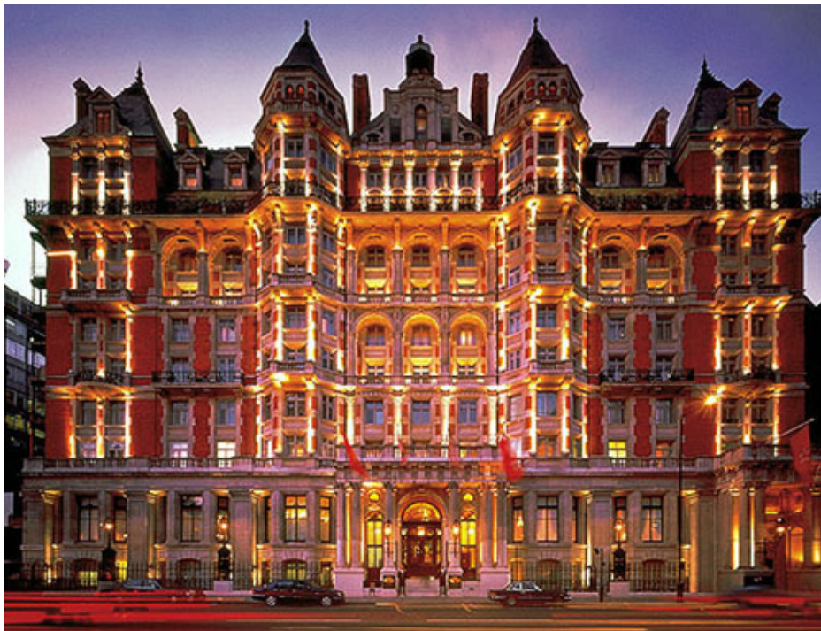
Mandarin Oriental Hotel in Knightsbridge, London

But arrive for the Derby I did, two days before the great race. I checked into the Mandarin Oriental in Knightsbridge.