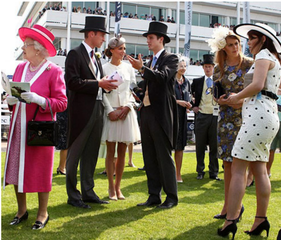
The presence of Her Majesty the Queen of England on Derby Day every year

The tension, the anxiety, the weight of expectation, the awful possibility of failure made me turn to Confucius for consolation. 'Better,' that sage suggested, 'to travel hopefully than to arrive'.