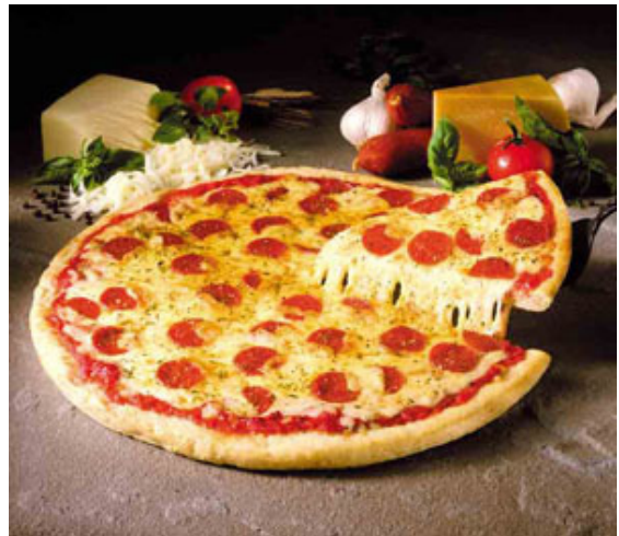
Pizza, I like Pizza