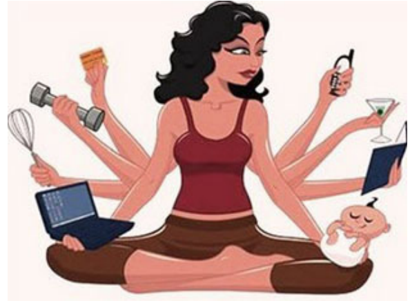
Mother encourages us to acquire as many skills as possible

One such opportunity to experiment that I have rejected concerns food. I like pizza, so I indulged this passion in the Harrods Pizzeria..