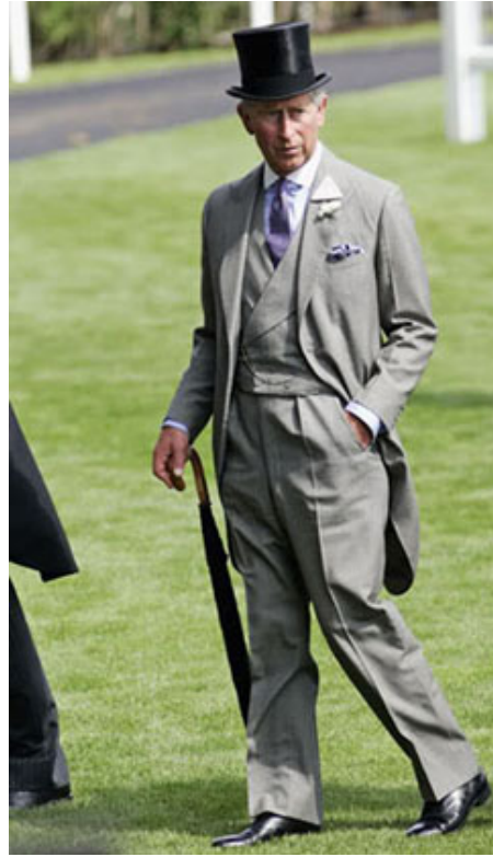
HRH Prince Charles at Epsom on Derby day