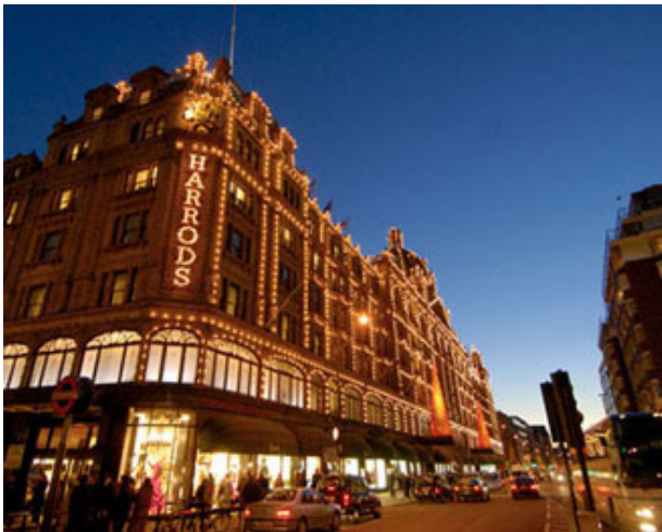
Famous Harrods Department store in Knightsbridge

One such opportunity to experiment that I have rejected concerns food. I like pizza, so I indulged this passion in the Harrods Pizzeria..