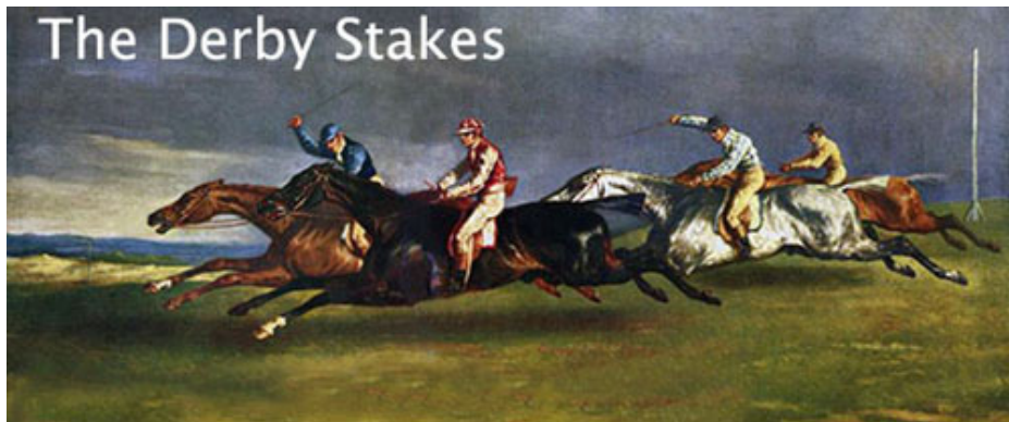
Derby, The Blue Riband of the Turf

I don't like long distance flights and not just because I'm over six feet tall. They leave you too long alone with your thoughts. This one – from Hong Kong to Heathrow – had been the worst of my twenty-seven years' existence. Sea The Stars – my horse – was favourite for the Derby, the greatest flat race on earth, the Blue Riband of the Turf.