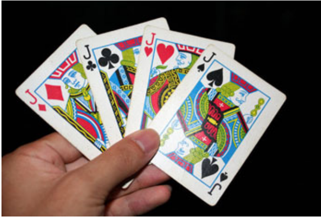
Mother is a femme a tout faire