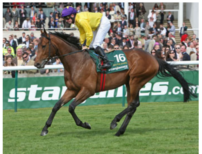
Sea The Stars foaled in 2006 by Cape Cross out of Urban Sea

Can Sea The Stars emulate Nashwan tomorrow? Can Urban Sea emulate King Edward VII's Perdita II? Can the rain please, please hold off until after the Derby?