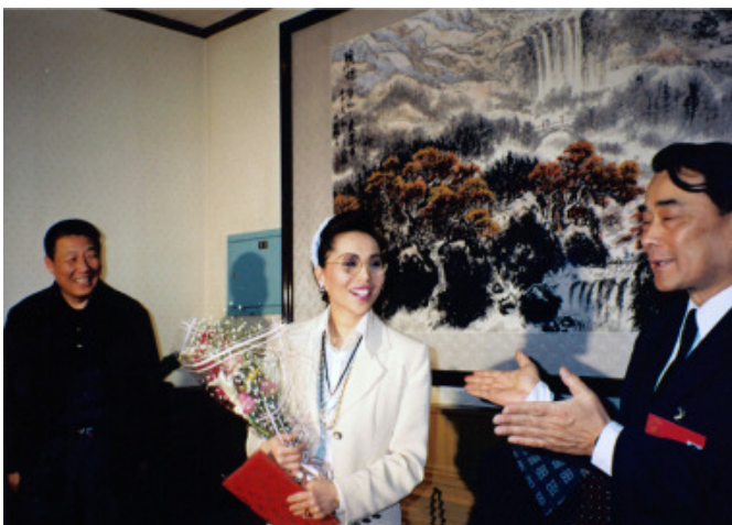
Ministry of Aerospace, Professor Sun Jiadong