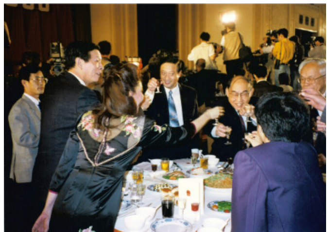
Mr. Liao Hui (left) - former Director of Hong Kong and Macao Affairs