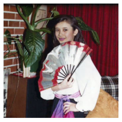
My god daughter famous ballet star Chen Hon Goh